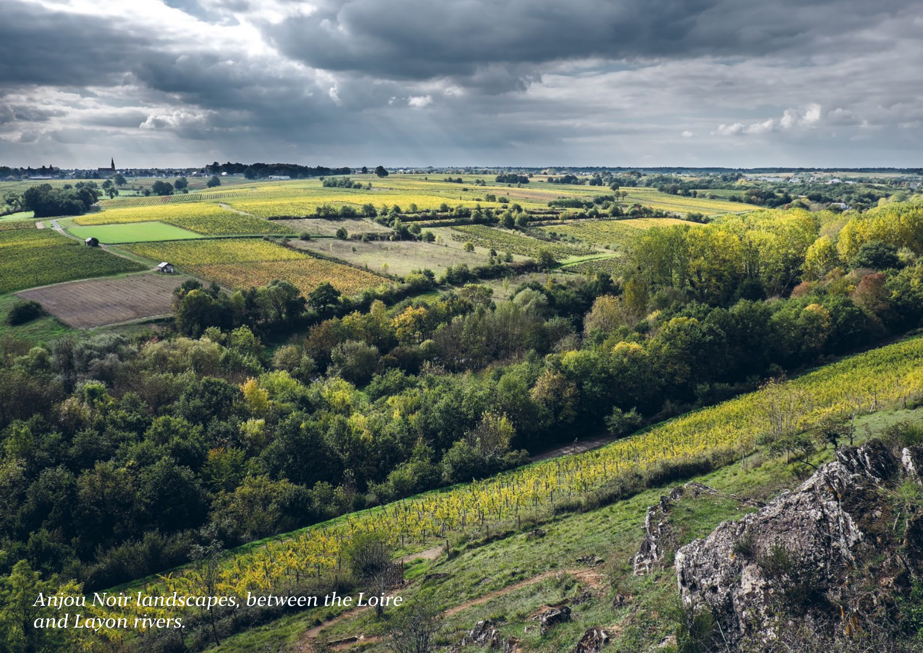
Anjou Noir landscapes, between the Loire and Layon rivers.