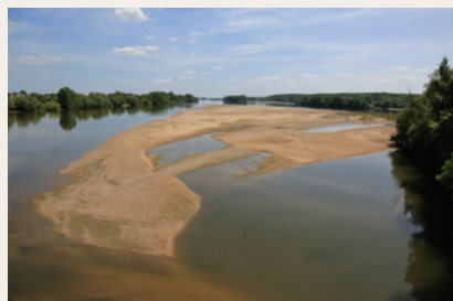
Sand banks in Gennes

needs are estimated at 600,000 tons. After sowing (carrots, lamb's lettuce, radishes), a fine layer of sand is spread over the land to loosen heavy soil. The soil will thus warm up quicker in spring. In this way sand contributes to the early growth, taste and renown of vegetables from Nantes region. The market gardeners of the Nantes area now use sea sand, some of which probably comes from the Loire.