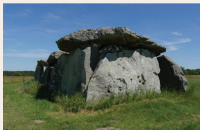
Dolmen of la Madeleine in Gennes