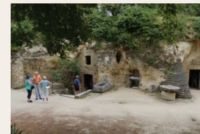
Village troglodytique in Rochemenier

Throughout the Saumur region, there are hundreds of kilometers of underground galleries cut out of the Tuffeau. The temperature is 12°C all year round!