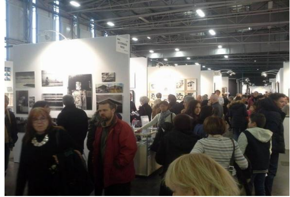
Upside : La corbata rosa at the Salon international d'art contemporain de Nantes.

Founded in 2013, la corbata rosa is a current art gallery. Its aim is to make the purchase of current art artworks accessible to the general public as well as professionals. The artists supported by the gallery are all alive, famous and have already been exhibited in order to diffuse and sell their works during temporary, permanent, physical or even digital exhibitions.